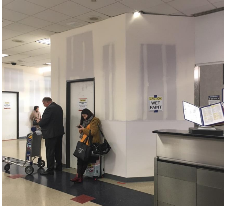
Terminal 4, Arrivals Level