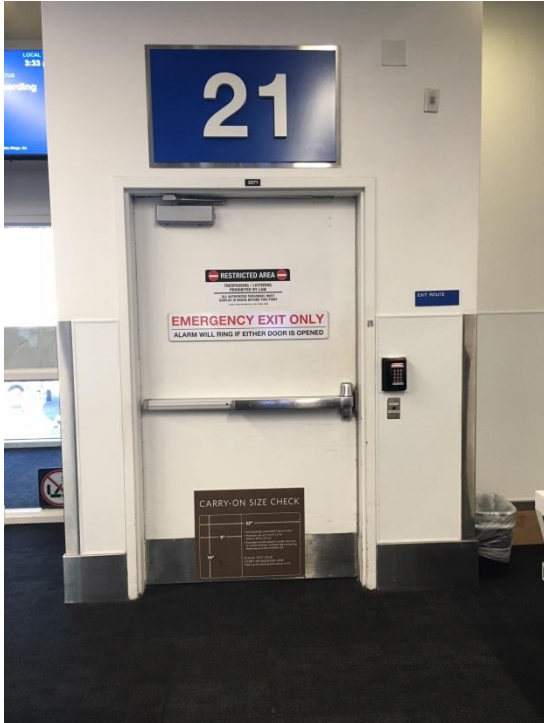
Gate 21, Terminal 2