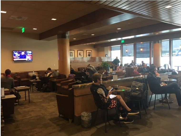
Alaska Airlines Lounge Terminal 6