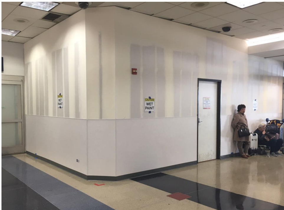
Terminal 4, Arrivals Level