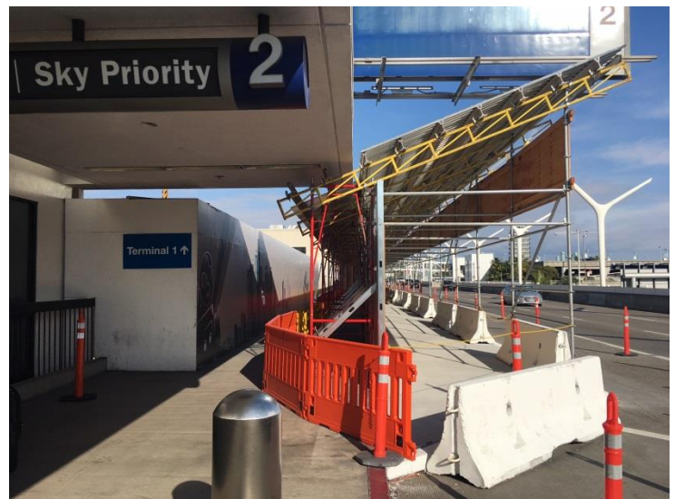
Departures Level, Curbside (between Terminals 1 & 2) Canopy Construction