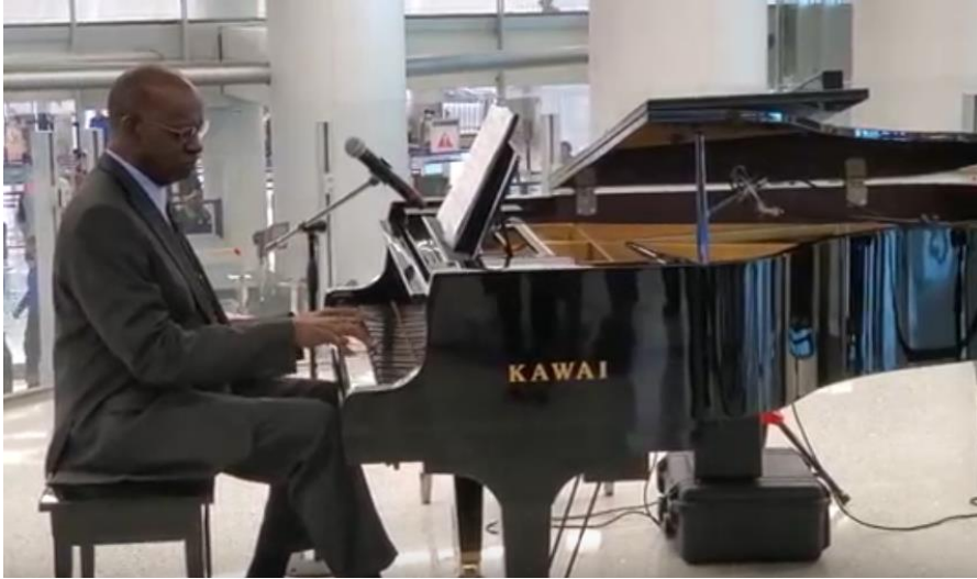
Terminal 7, Concourse Baby Grand Piano available for guests to play