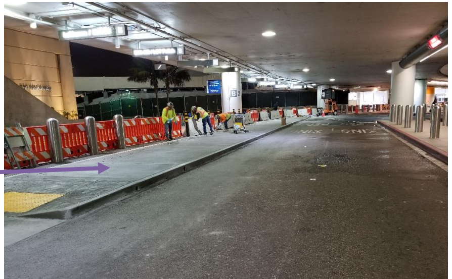
Terminal B, Arrivals Level Temporary Pedestrian Walkway