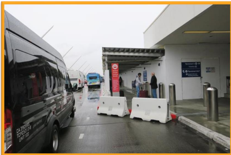
Terminals 5 / 6: Departures Level Pedestrian Walkway