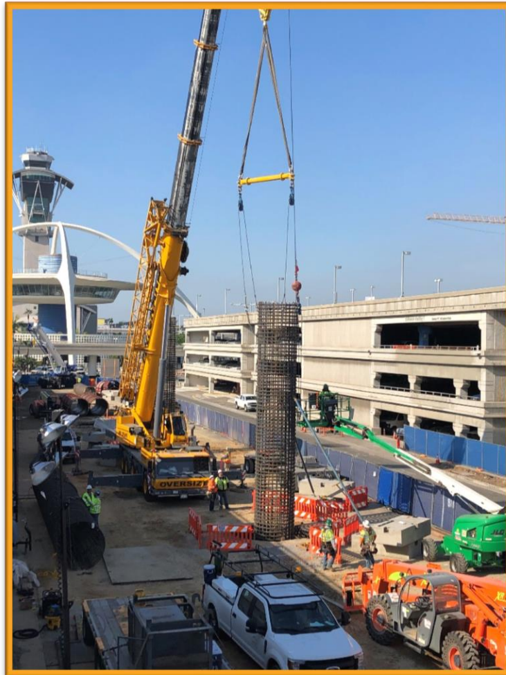
Center Way from PS-7 looking west: APM CIDH Pile Work