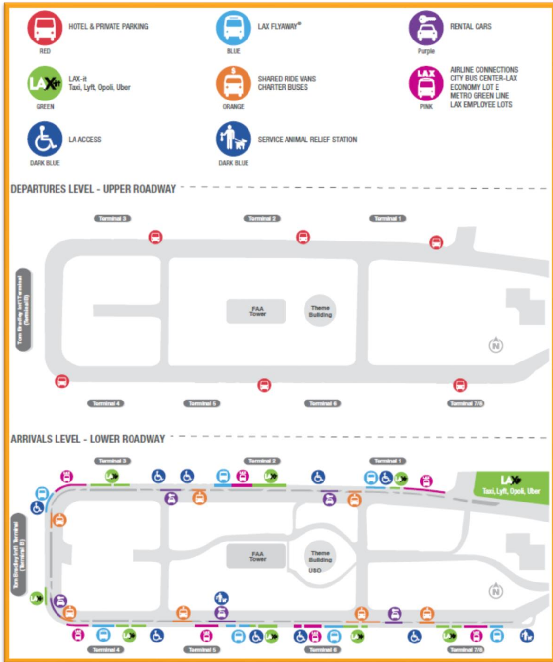
Ground Transportation Waiting Areas as of 12/2/19