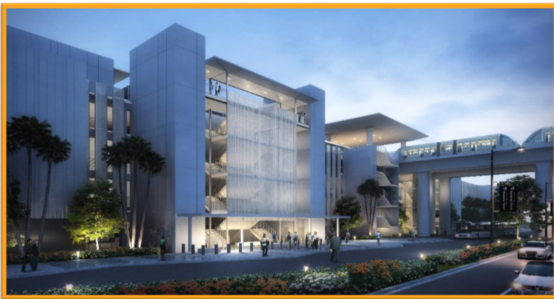
ConRAC final rendering