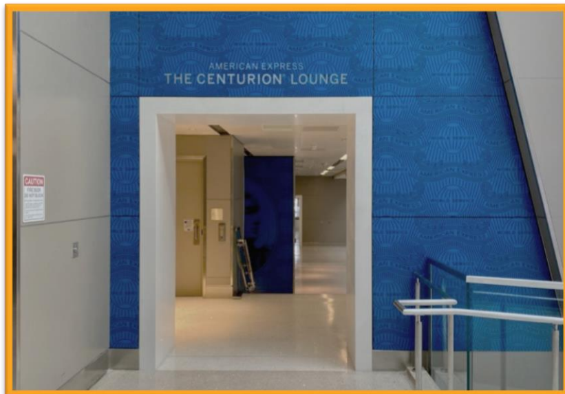
One entrance to the Centurion Lounge Terminal B, Level 4