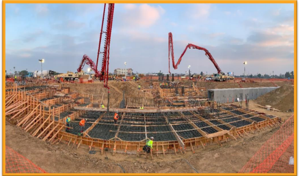
ConRAC's first foundation pour