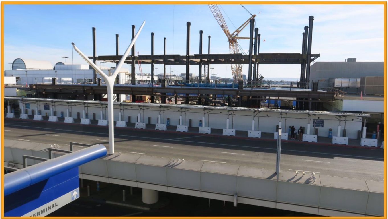
Terminal 5.5 structural steel is visible airside as construction progresses on the project