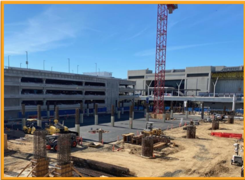
APM construction at future West Station site January 15, 2021