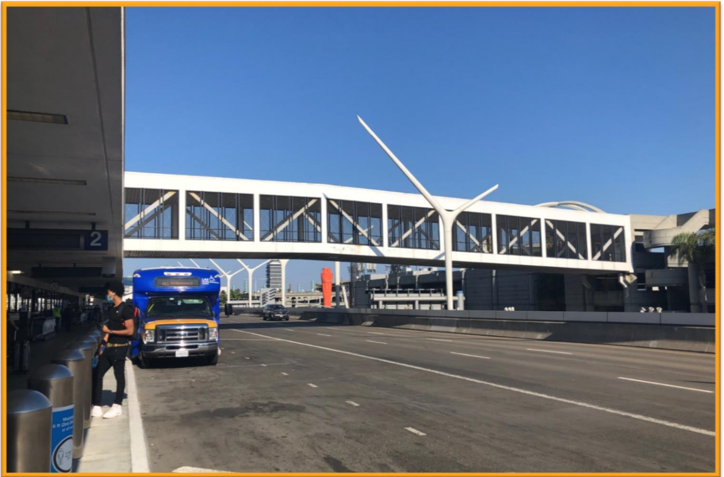
Pedestrian Bridge between Terminal 2 and Parking Structure 2A, pictured from the Departures Level roadway looking east