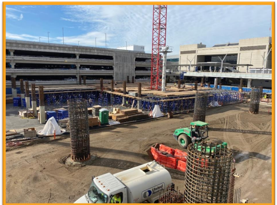
APM construction at future West Station site January 29, 2021