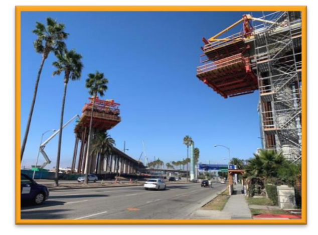
APM Guideway to be built over Century Boulevard