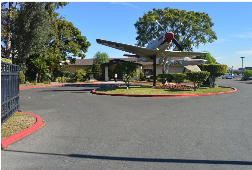
Proud Bird Restaurant (#115, 11022 Aviation Boulevard, 1967)