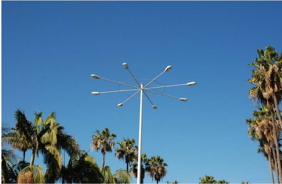
Detail of the eight-armed light poles