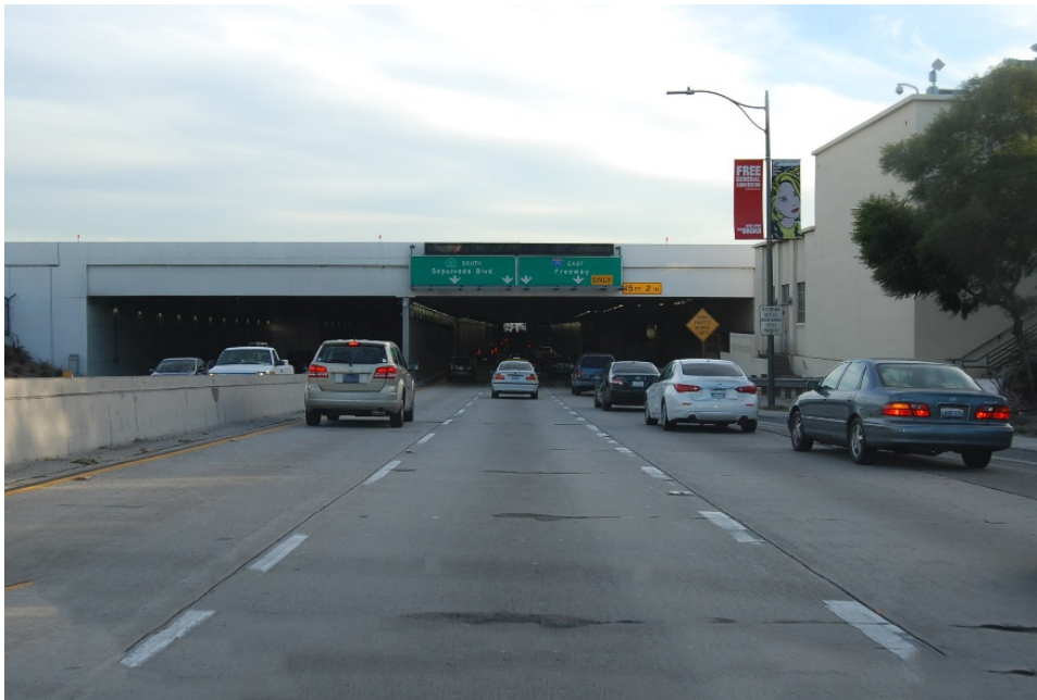
Sepulveda Tunnel (#160, Sepulveda Boulevard, 1951-1953)