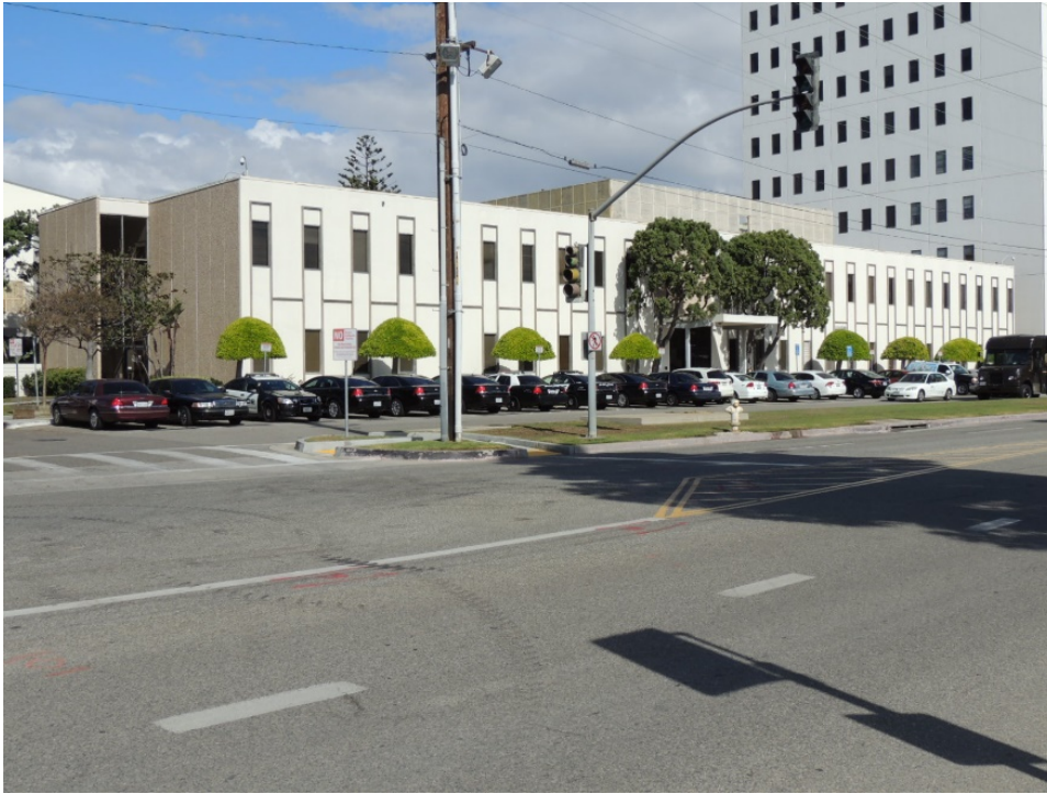
Flying Tiger Line World Headquarters – Office building (#61, 7303 World Way West, 1965-1972)