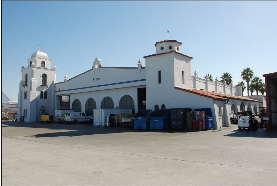
Hangar One (#109, 5701 W. Imperial Highway, 1929)