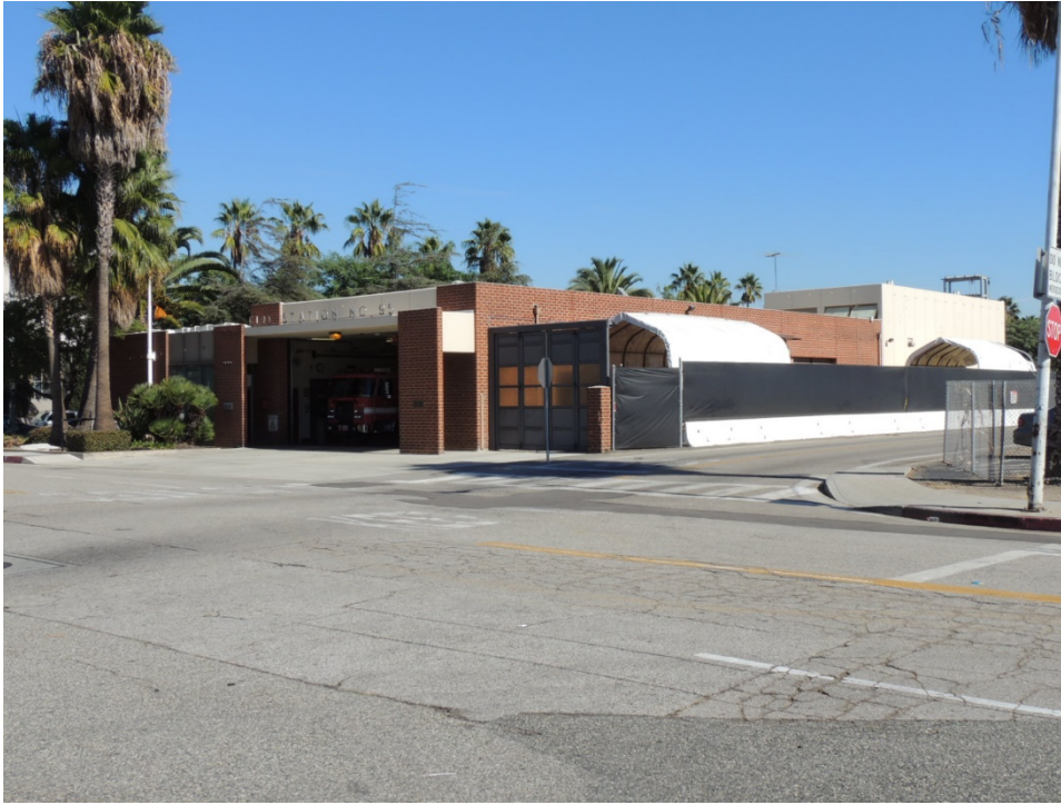
Fire Station No. 95 (#240, 10010 International Road, 1958-1959)