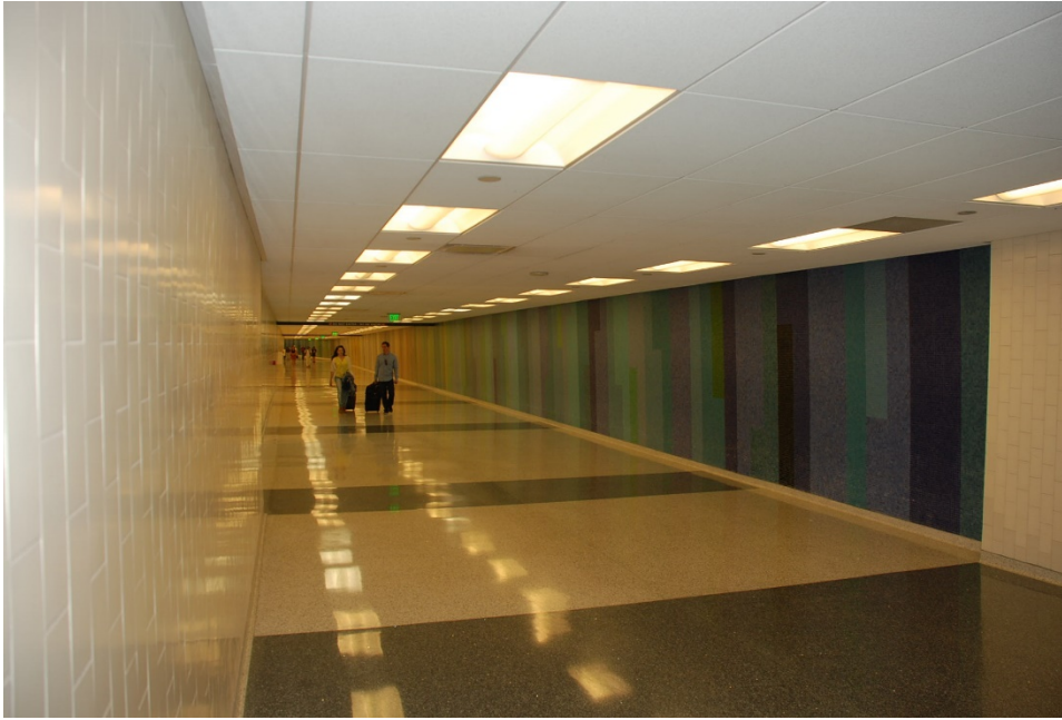
Overview of ceramic tile wall cladding and abstract ceramic mosaic tile mural in Tunnel to Baggage Claim.