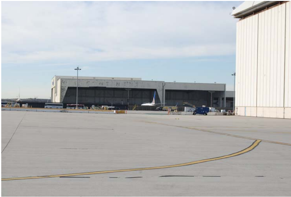
Continental Airlines Training Center Building (#58, 7227 World Way West 1963)