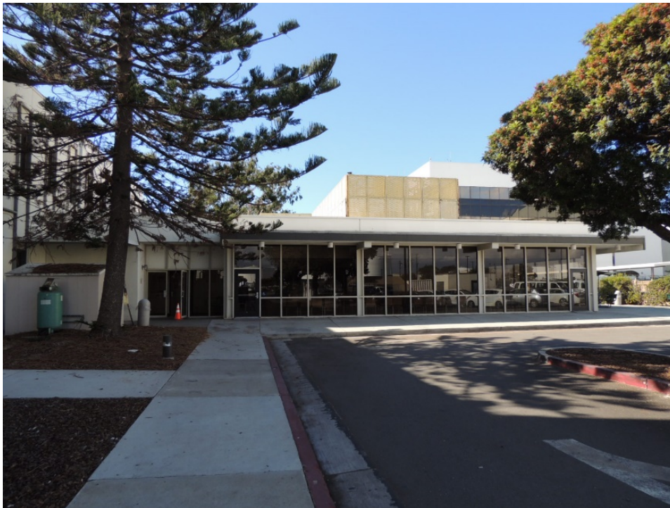
Flying Tiger Line World Headquarters – Cafeteria (#62, 7307 World Way West, 1965-1972)