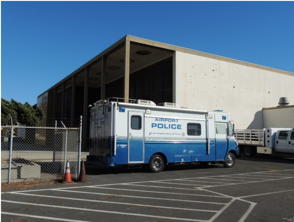
Continental Airlines Training Center Building (#63, 7320 World Way West 1966)