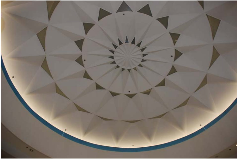
Detail of the rotunda ceiling in Terminal 7