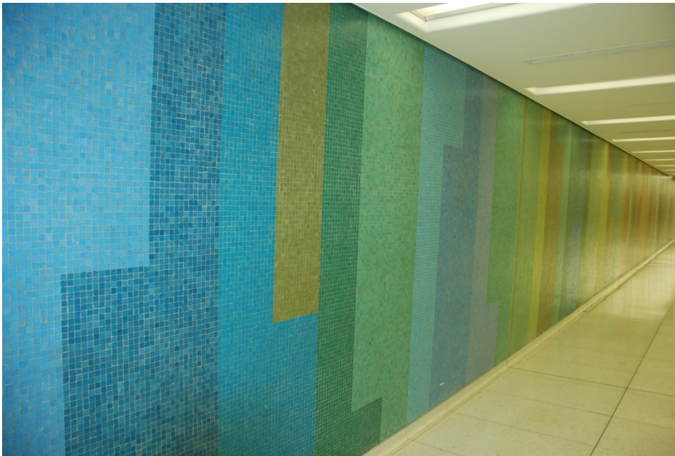
Detail of the ceramic tile wall cladding and abstract ceramic mosaic tile mural.