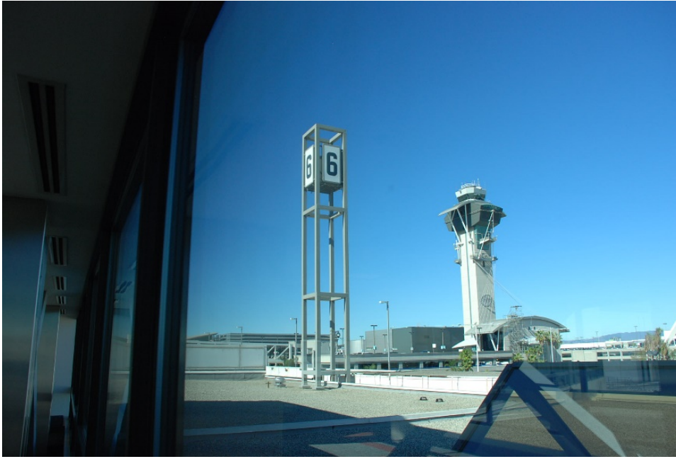
Terminal 6 Pylon (600-650 World Way, 1961)