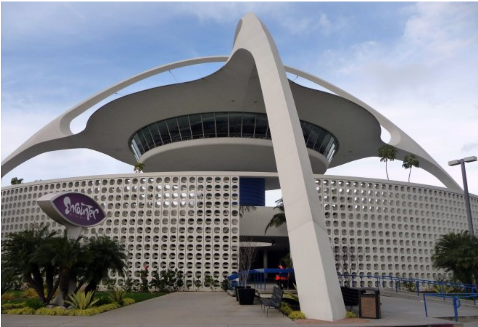
LAX Theme Building (#28, 201 World Way, 1962)