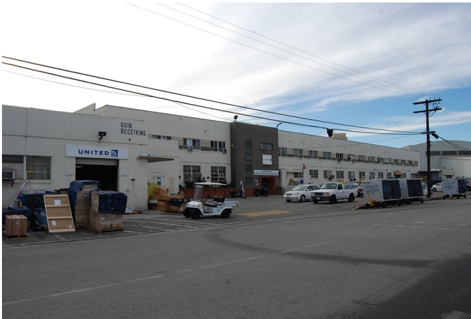
Intermediate Terminal Facility (#134, 6010-6024 Avion Drive, 1945-1947)