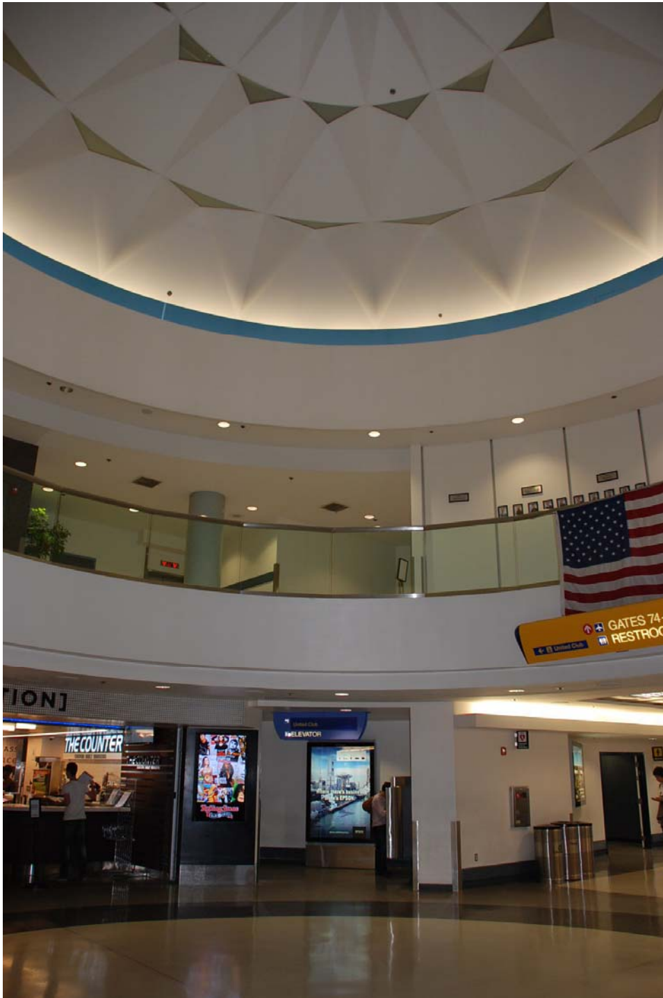
Overview of rotunda in Terminal 7