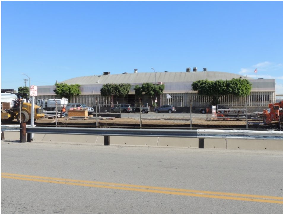
10200 Aviation Boulevard. (#122, 1950)