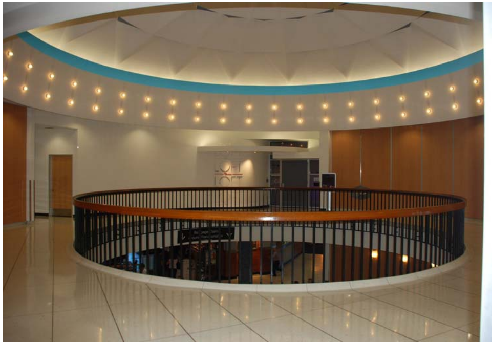
Overview of the rotunda in Terminal 3