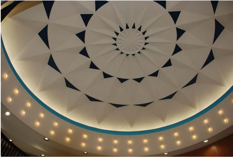
Detail of the rotunda ceiling in Terminal 3