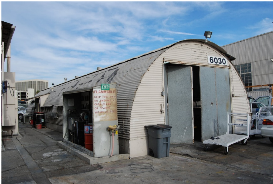
Quonset Hut (#142, 6030 Avion Drive, c. 1943)