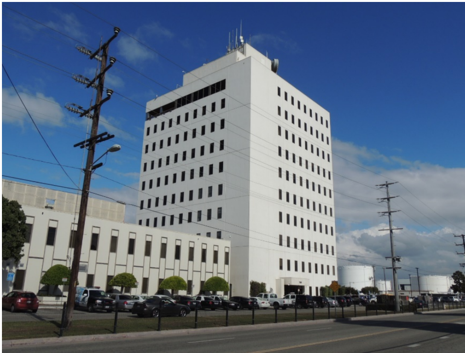
Flying Tiger Line World Headquarters – 10-story Office Building Addition (#60, 7301 World Way West, 1965-1972)