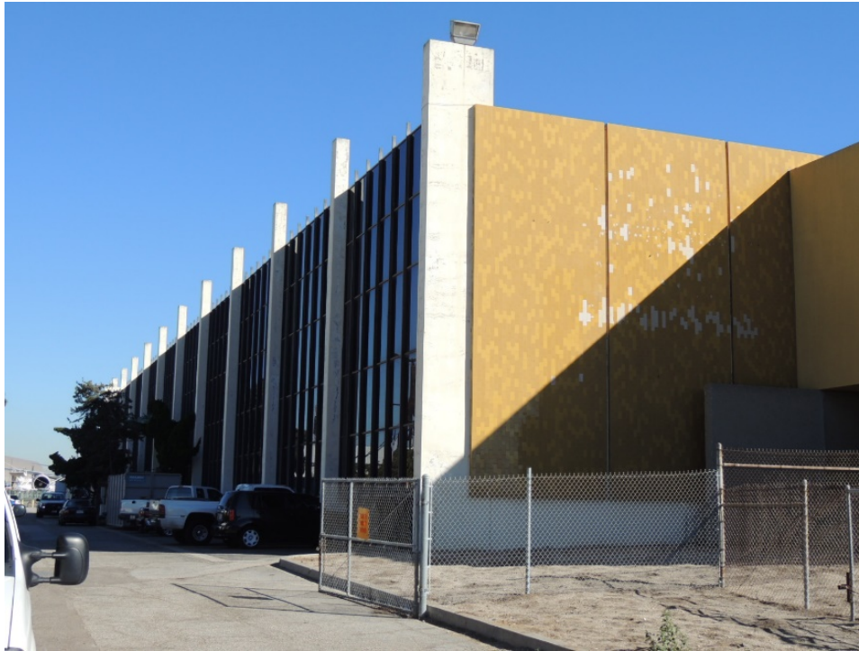
Continental Airlines General Office Building (#58, 7270 World Way West 1963)