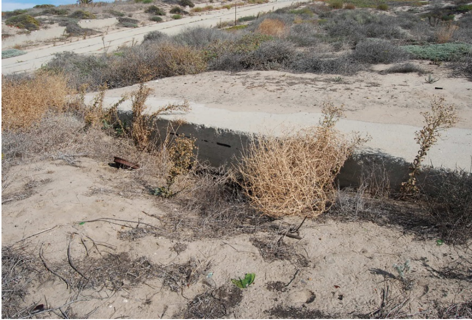
World War II Munitons Storage Bunker (1942-1943)