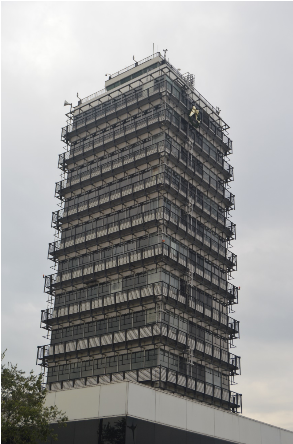
Airport Traffic Control Tower (#1, 1 World Way, 1961)