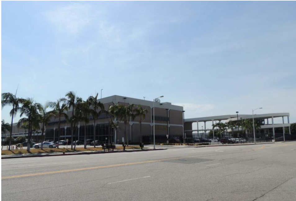
Regional Post Office Facility (#128, 5800 W Century Boulevard, 1967)