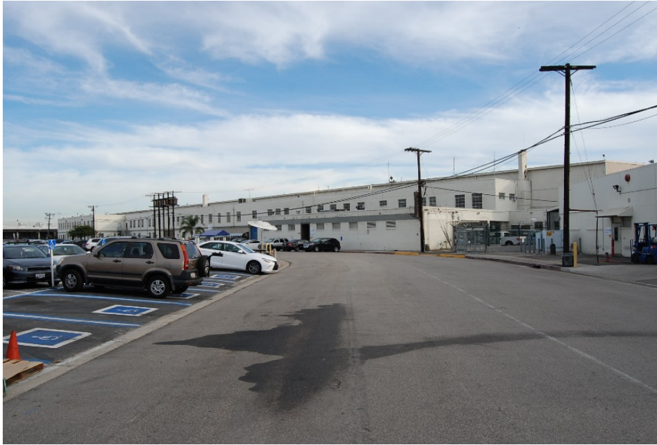
Intermediate Terminal Facility (#133, 6000 Avion Drive, 1945-1947)