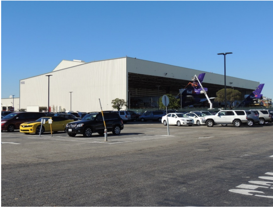
Flying Tiger Line World Headquarters – Maintenance Hangar (#65, 7401 World Way West, 1965-1972)