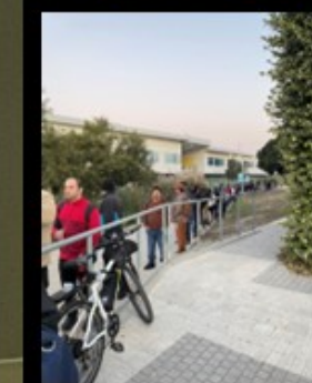
HireLAX Apprenticeship Readiness Program Orientation January 11, 2025