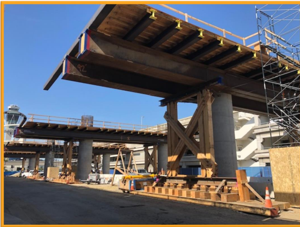
Foundation piles and falsework on Center Way for the APM Project