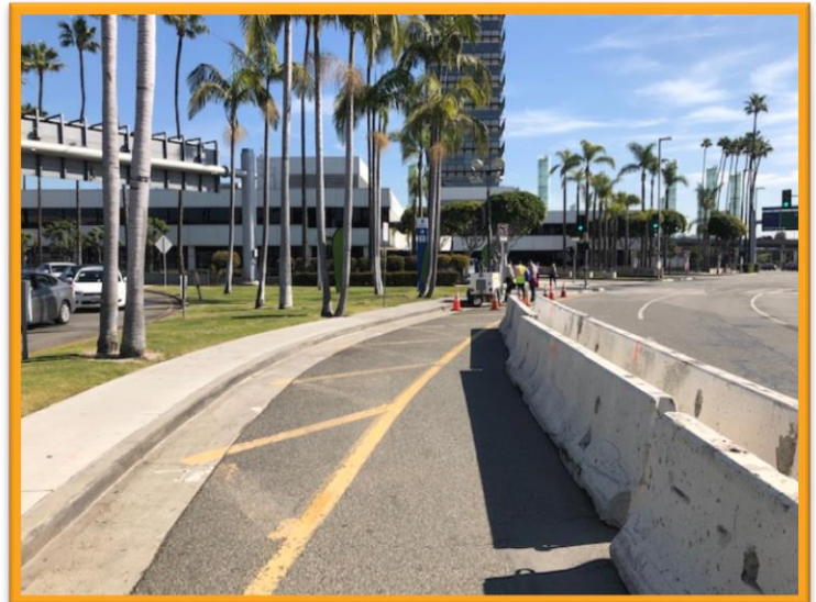
Sidewalk to be closed during APM construction