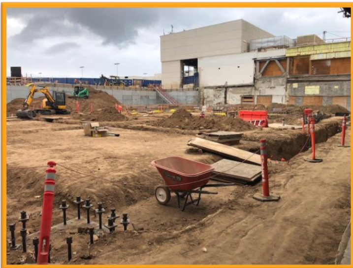
T5.5 airside trenching & foundation work