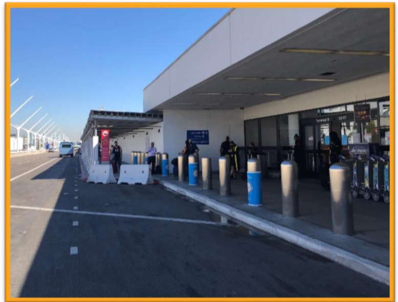
T5.5 landside Departures Level temporary walkway