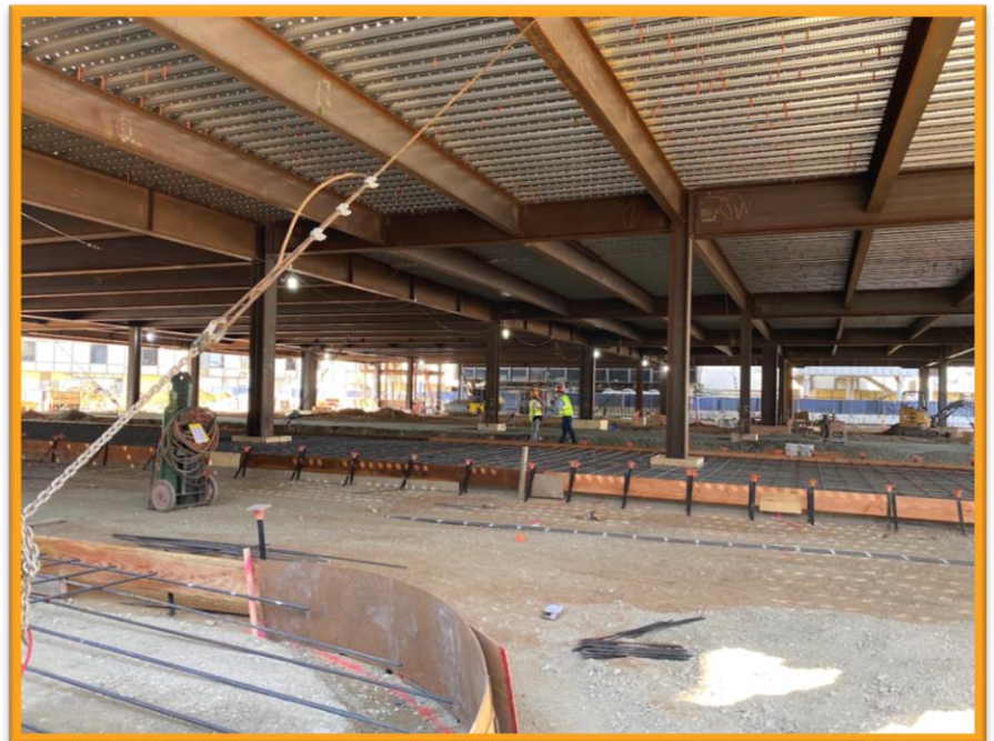
Terminal 3 (interior decking)