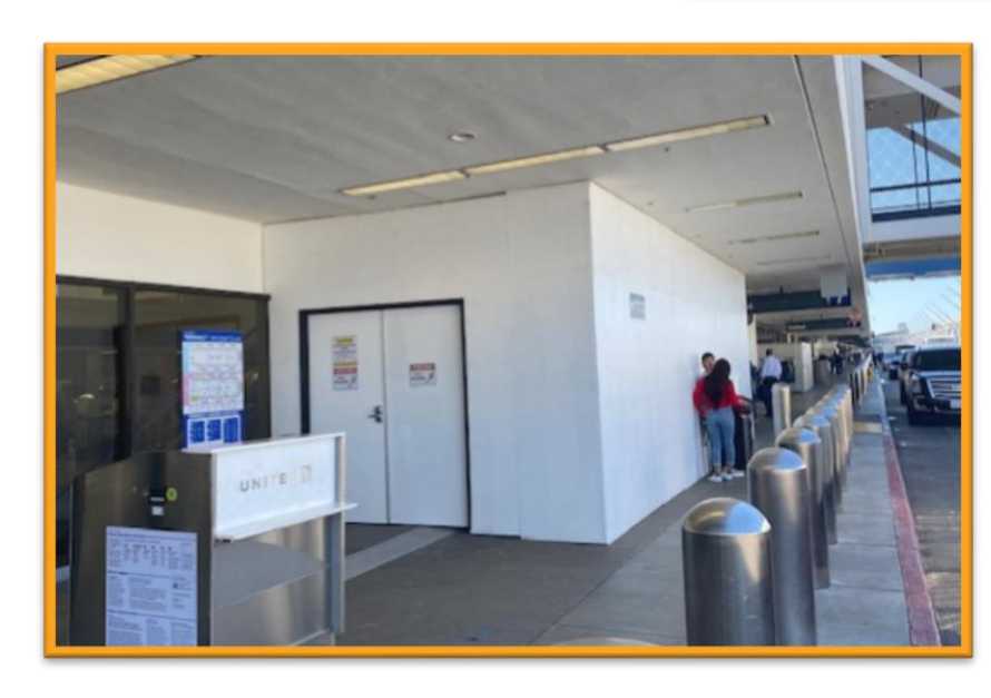
Terminal 7 Construction Barricades