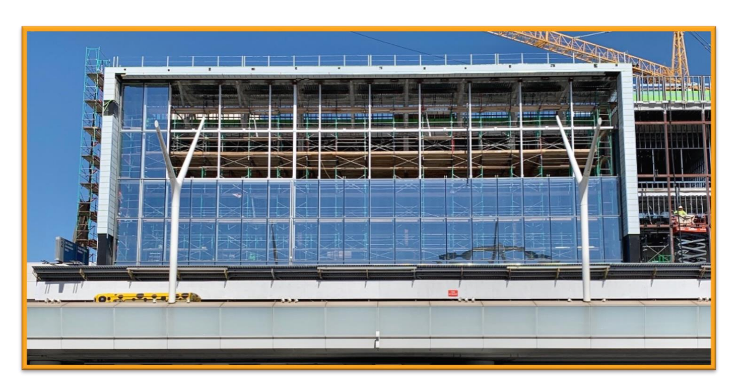
Terminal 1.5 as of Monday, March 2, 2020