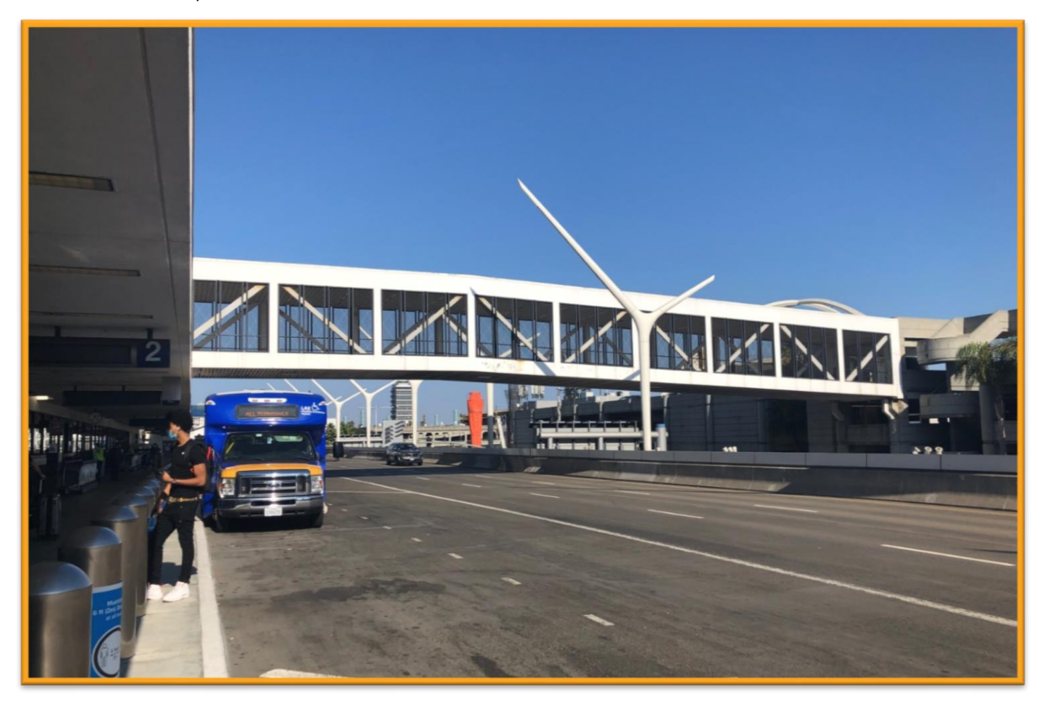
Pedestrian Bridge between Terminal 2 and Parking Structure 2A, pictured from the Departures Level roadway looking east