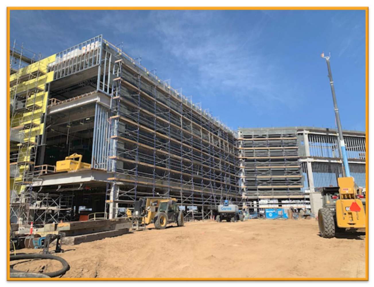
Terminal 2 / 3 Head House (top) and Terminal 3 Concourse construction (bottom)