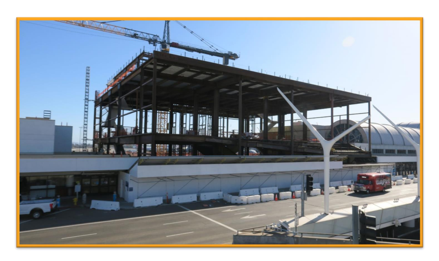
The future Terminal 4.5 Core building takes shape, pictured from Parking Structure 5