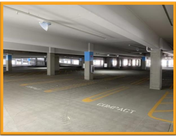
Top: Current ITF-West construction progress; Bottom Left: Rendering of final ITF-West facility; Bottom Right: Inside ITF-West Parking Structure