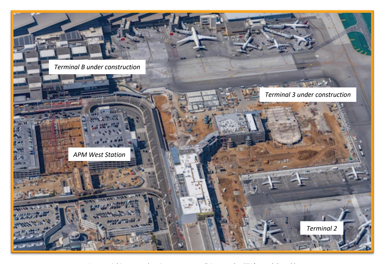
New aerial imagery showing current conditions at the CTA's north knuckle